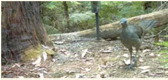
Leaf-litter, logs & undergrowth make great habitat!

Fallen trees and limbs offer habitat, refuge and perching sites for numerous creatures, fungi, mosses and lichens. As they slowly rot over a long period of time, their decomposing timber returns stored nutrients to the soil, for the benefit of nearby plant and animal life.